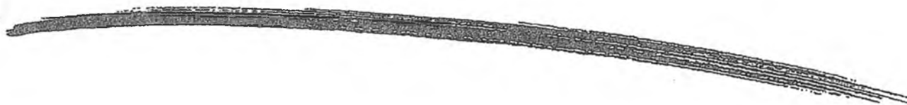
EXHIBIT "A" Submitted Real Estate