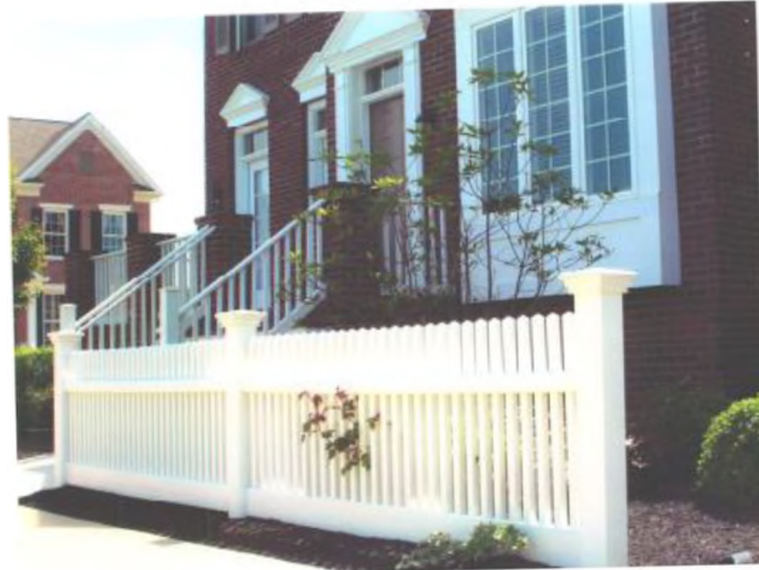
Manchester Scalloped - 4'x8' Section